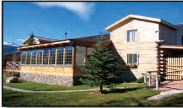
Base Camp/Main Lodge