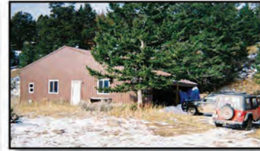
Spike Camp 2/Divide Creek