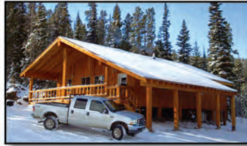
Spike Camp 1/Shoe Box